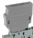
ASI014440-Fuse Holder Plug (5 x 20 mm Fuse)