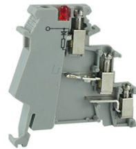
ASI011170-Distribution Actuator Terminal Block