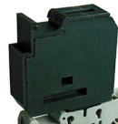
ASI014445-Component Holder Plug