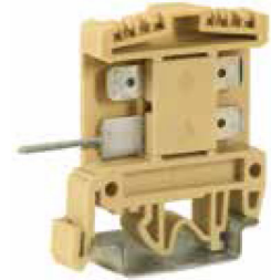
with 1.6 x 0.8 mm lug for wrapped wire connections