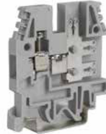
6.3 x 0.8 mm, or 2.8 x 0.8 mm, flat push-on tab connections, compliant with the IEC 60760 Standard